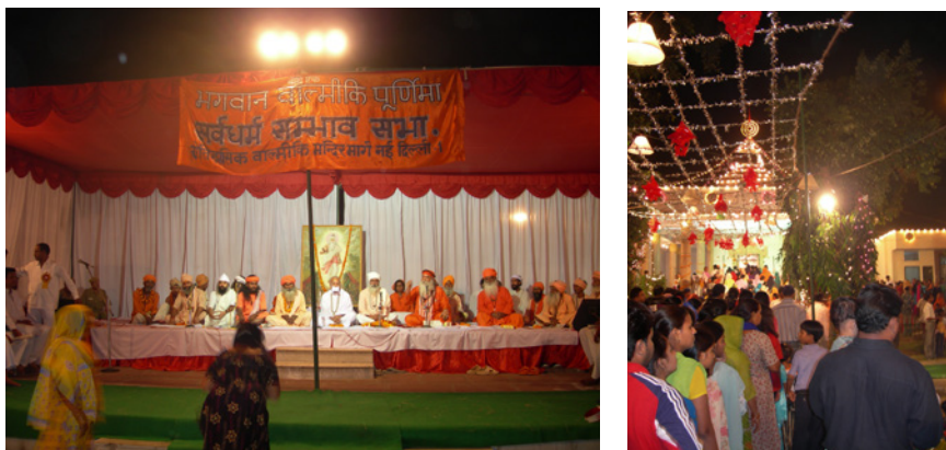
Figure 2, Figure 3: The celebration of Valmiki Jayanti at Bhagwan Valmiki Mandir of Mandir Marg of Delhi.