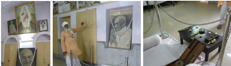
Figures 5,6,7. Pictures from Valmiki Temple, New Delhi

What is the relationship between the Valmiki Temple in Delhi and Gandhi? Gandhi chose Valmiki Temple in Delhi as a place where he could effectively promote his Harijan movement. The room in the temple where Gandhi stayed was preserved and kept open for visitors. The desk, pen, glasses, and charkha (a manual spinning wheel) 14 used by Gandhi were displayed. In addition, the surrounding walls were decorated with portrait photographs of Jawaharlal Nehru and other Congress leaders who had visited Gandhi, as well as Stafford Cripps (1889–1952), Louis Mountbatten (1900–1979), the governor-general of India, and other prominent figures. Photographs of Indian and British politicians and activists adorn the walls. Little is it known today that the temple was not only a place where caste Hindus could highlight their connection to the upliftment of Dalits through the Harijan movement but also an essential space that perhaps determined the political landscape 15 (Figures 5, 6, and 7).