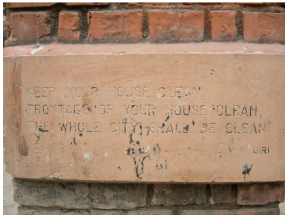
Figure 1. Stone monument was established in Colony A.

“Keep your house clean. Frontage of your house clean. The whole city shall be clean.” – V. V. Giri