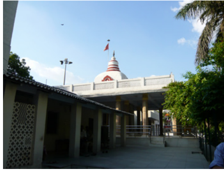
Figure 4: Bhagwan Valmiki Mandir at Mandir Marg of Delhi.

What is the relationship between the Valmiki Temple in Delhi and Gandhi? Gandhi chose Valmiki Temple in Delhi as a place where he could effectively promote his Harijan movement. The room in the temple where Gandhi stayed was preserved and kept open for visitors. The desk, pen, glasses, and charkha (a manual spinning wheel) 14 used by Gandhi were displayed. In addition, the surrounding walls were decorated with portrait photographs of Jawaharlal Nehru and other Congress leaders who had visited Gandhi, as well as Stafford Cripps (1889–1952), Louis Mountbatten (1900–1979), the governor-general of India, and other prominent figures. Photographs of Indian and British politicians and activists adorn the walls. Little is it known today that the temple was not only a place where caste Hindus could highlight their connection to the upliftment of Dalits through the Harijan movement but also an essential space that perhaps determined the political landscape 15 (Figures 5, 6, and 7).