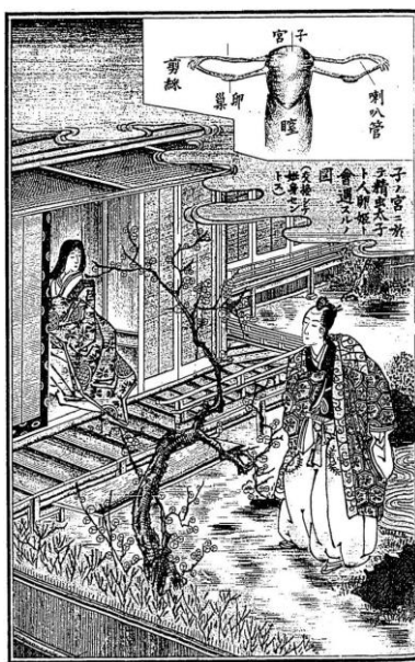
Figure 1: The prince visits the princess in ko no miya , or the palace of the child.

Nadaoka Komataro's Jinshin tainai seijiki [The Record of Political Affairs in the Human Body] (1889) closely mirrors the popularity of zōkaki-ron and incorporates the author's knowledge from the zōkaki-ron books in the form of comments added to the story. The book seemingly presents educational stories about the function of essential organs in the human body. Each body part and its functions are compared to lives and duties in society, like present-day children's educational books about how the human body works. Bodily operations are generally divided into the imperial sphere and the governmental sphere, respectively representing the mental work of the brain or nervous system and the physical needs and activities of the body. For example, the Ministry of Internal Affairs conducts duties related to nutrition and blood circulation, and the Army manages muscles and motion. The novel details the "great festivals" or holidays for all residents' shrine visits to celebrate imperial marriage. The newly coined word for the womb in this period is literally the imperial residence for a child ( shikyū , or ko no miya ), and the miya , the imperial residence or shrine, securely holds a princess (Figure 1). Once the imperial